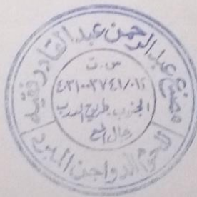
السيد/ محمد سعيد مدير الموارد البشرية مصنع فقيه للدواجن أبها - المملكة العربية السعودية